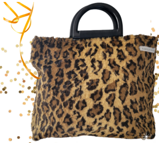
IN THE WILD