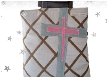
MIGHTY WOMEN OF VALOR