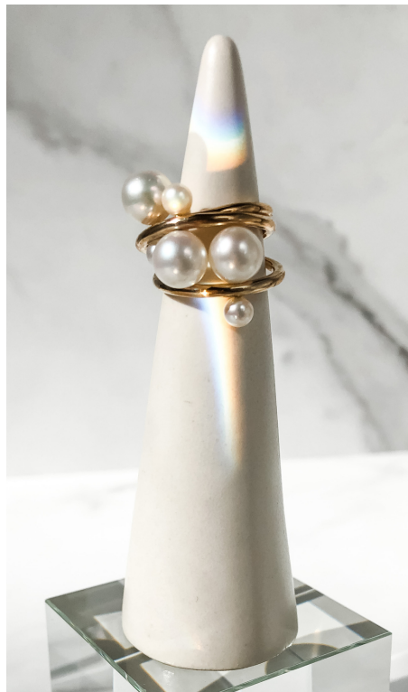
o7 | double pearl ring