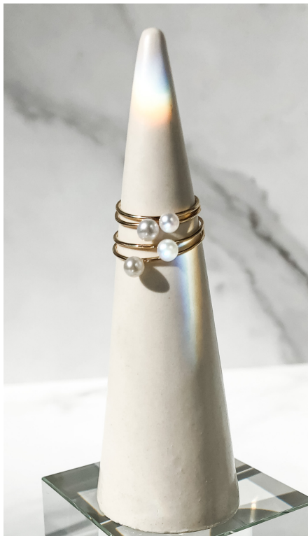
o6 | stacking ring