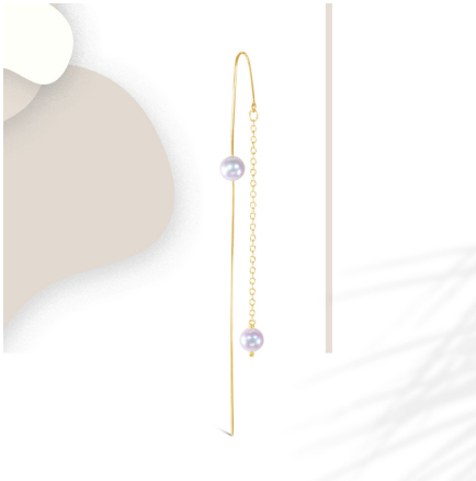
14K Long Ear Threader with Chain WS $255 MSRP $560

Solid 14k gold ear threader with two Akoya grade A pearls 7-7.5mm.