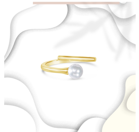
14K Open Single Pearl Ring WS $375 MSRP $825

Solid 14k gold lost wax cast boat with approximately a little under three carats of VS-SI diamonds Color G, Clarity H, and Herkimer diamond accents.