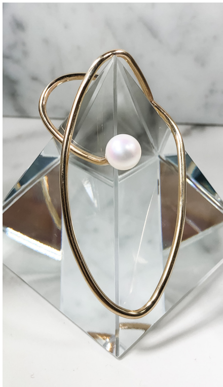
10 | ear cuff