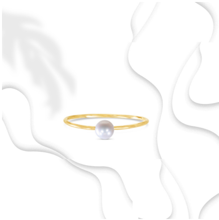
14K Single Pearl Stacking Ring WS $95 MSRP $195

Solid 14k gold 19 gauge wire band with a single 4-4.4mm freshwater grade A pearl. Sizes 5,6,7,8.