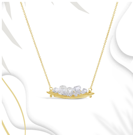
14K Diamond Boat Necklace WS $2245 MSRP $4,940

Solid 14k gold earrings that can be reversed as an ear climber with six 4.5-4.9mm, two 5.5-5.9mm, two 7-7.4mm freshwater grade A pearls.