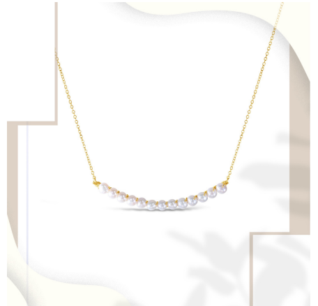
Gold-Filled Pearl Bar Necklace WS $110 MSRP $230

Hand-fabricated 14k gold-filled necklace with a single Akoya 5mm grade AA pearl.