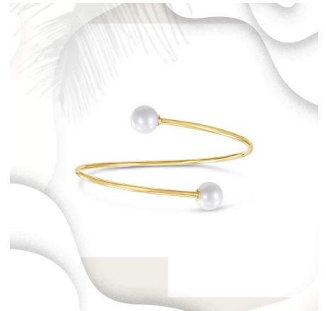
Gold-Filled 2 Pearl Open Bracelet WS $165 MSRP $365

Hand-fabricated 12 gauge 14k gold-filled ring with 8-8.4 mm grade A and 4.5-4.8mm grade A freshwater pearls.