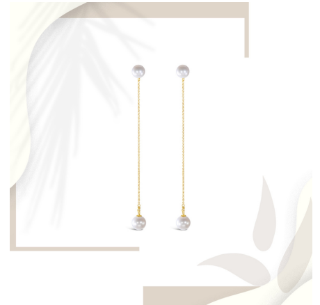
14K Two Pearl Post Earring with Chain WS $280 MSRP $615

Solid 14k gold post hoop earrings with chain attached to ear nut, ten Akoya 3mm grade AA pearls and two freshwater 8-8.4mm grade A pearls.