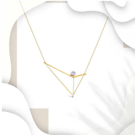
Gold-Filled Y-Bar with Single Pearl Necklace WS $175 MSRP $350

Hand-fabricated 12 gauge 14k gold-filled choker with two freshwater 9-10mm grade A pearls.