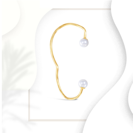
14k Gold-Filled Double Pearl Ear Cuff WS $145 MSRP $320

Hand-fabricated 12 gauge gold-filled ear cuff with one freshwater 8-8.4 mm grade A pearl.