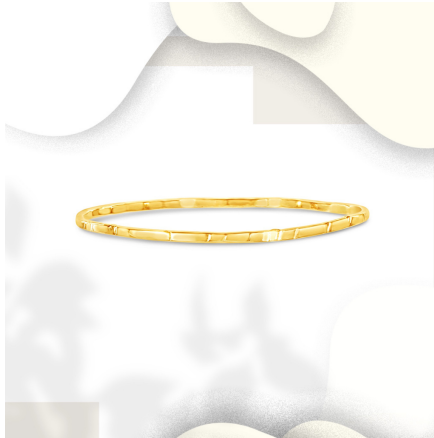
14k Gold-filled Single Stacking Bangle WS $60 MSRP $120

Solid 14k gold 19 gauge wire band with a single 4-4.4mm freshwater grade A pearl. Sizes 5,6,7,8.