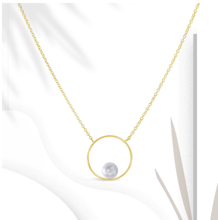
14K Single Pearl Circle Necklace WS $310 MSRP $660

Hand-fabricated 14k gold-filled bar necklace with thirteen 6-6.5mm freshwater grade A pearls.