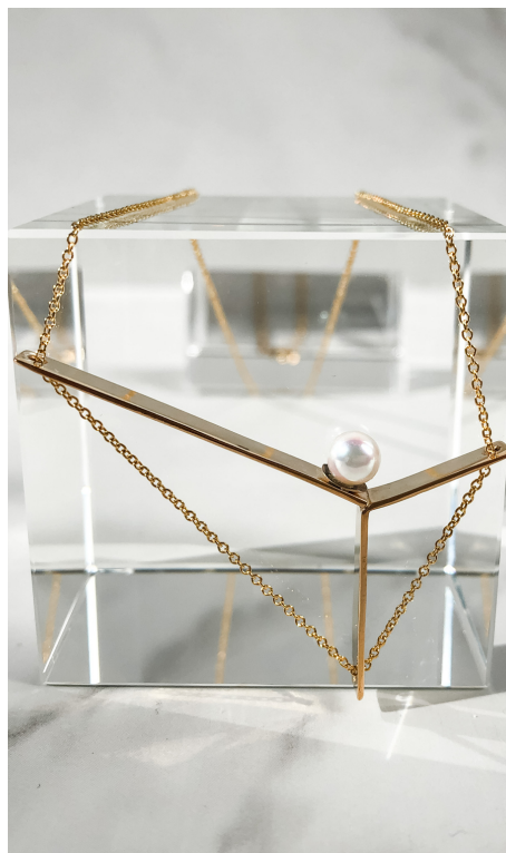
16 | y-bar