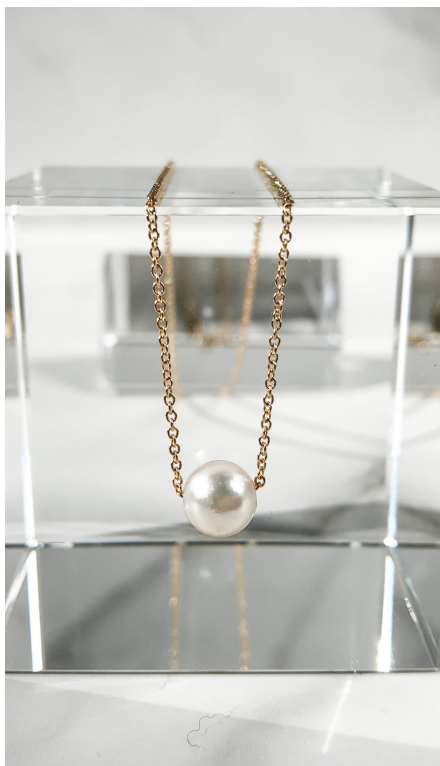
15 | single pearl