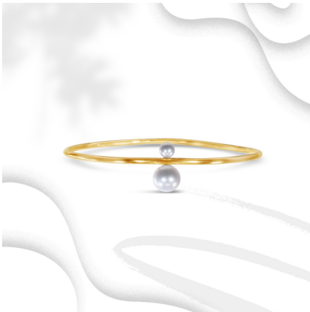
Gold-Filled Large/Small Two Pearl Bangle WS $135 MSRP $275

Hand-fabricated 12 gauge gold-filled ear cuff with 8-8.4 mm grade A and 4.5-4.8mm grade A freshwater pearls.