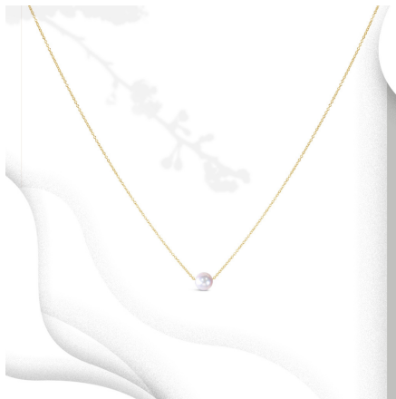
14K Single Pearl Necklace WS $280 MSRP $615

Solid 14k gold circle pendant with a single 5-5.5mm freshwater grade A pearl and 1mm oval cable chain.