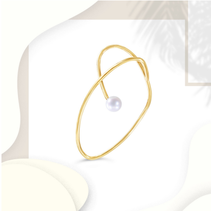
14K Gold-Filled Single Pearl Ear Cuff WS $120 MSRP $250

Hand-fabricated 12 gauge gold-filled ear cuff with one freshwater 8-8.4 mm grade A pearl.