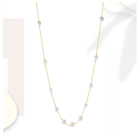
14K Long Multi-Pearl Necklace WS $495 MSRP $1,055

Solid 14k gold single Akoya 7-7.5mm grade A pearl and 1mm oval cable chain.