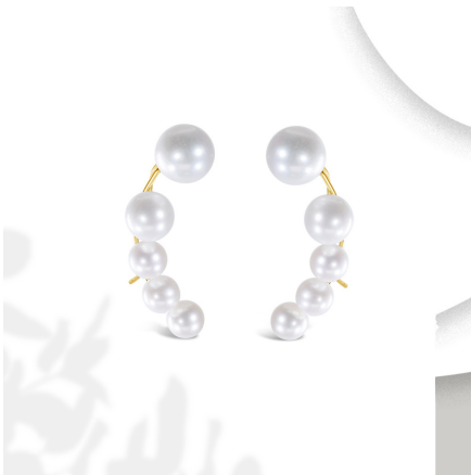
14K Ear Climber Earrings WS $220 MSRP $485

Solid 14k gold post earrings with chain drop attached to ear nut, two 7-7.4mm and 8-8.4mm freshwater grade A pearls.