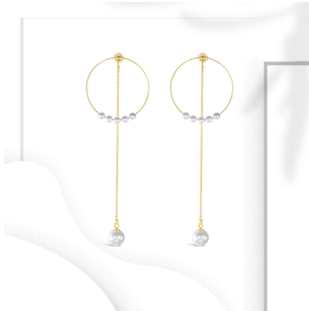
14k 5 Pearl Circle Earrings WS $660 MSRP $1,450

Solid 14k gold ear threader with two Akoya grade A pearls 7-7.5mm.