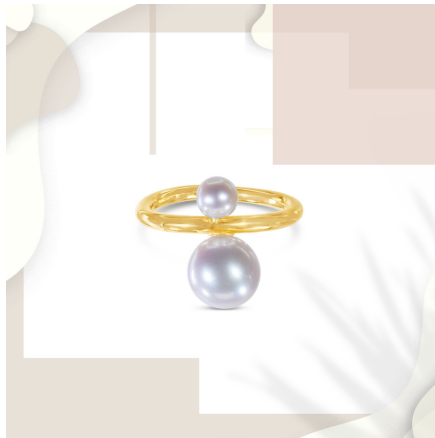
Gold-Filled Large/Small Two Pearl Ring WS $130 MSRP $260

Hand-fabricated 12 gauge 14k gold-filled bangle with 8-8.4 mm grade A and 4.5-4.8mm grade A freshwater pearls.