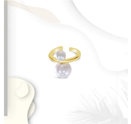
14k Gold-Filled Large/Small Two Pearl Ear Band WS $120 MSRP $250

Hand-fabricated 12 gauge gold-filled ear cuff with two freshwater 8-8.4 mm grade A pearls.