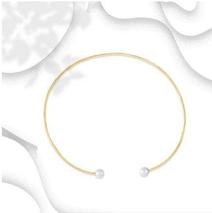
Gold -Filled 2 Pearl Choker WS $185 MSRP $410

Hand-fabricated 12 gauge 14k gold-filled choker with two freshwater 9-10mm grade A pearls.