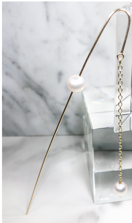
11 | ear threader