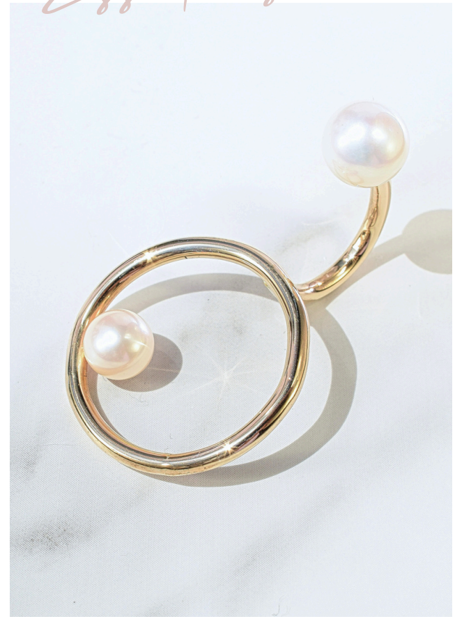
| DOUBLE FINGER RING