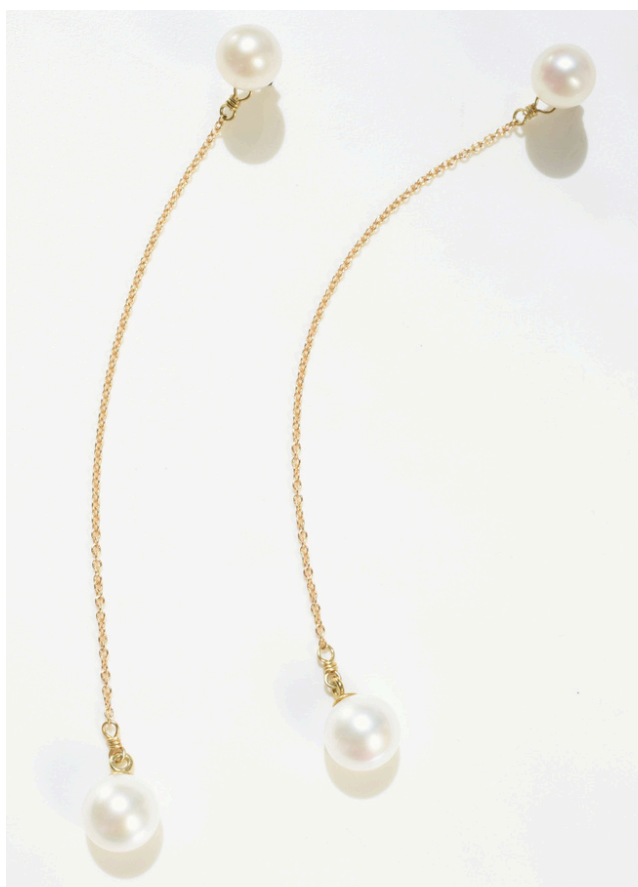
| ILLUSION DROP EARRINGS