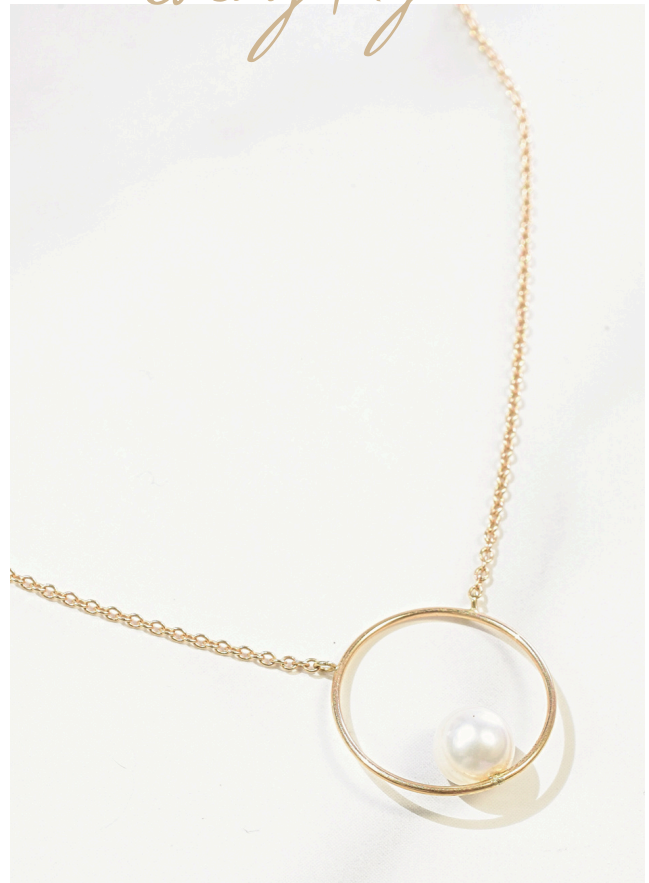
| CIRCLE FRAME PENDANT