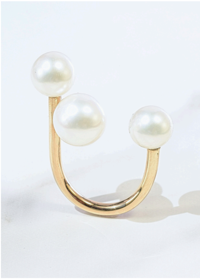
| THREE PEARL RING