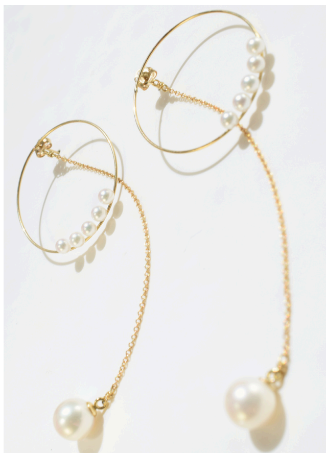
| ILLUSION HOOPS