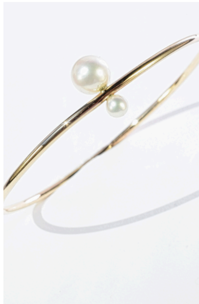
| PEARL BANGLE