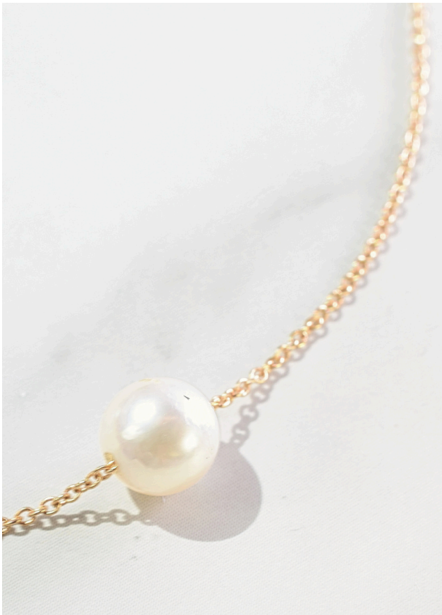
| SINGLE PEARL NECKLACE